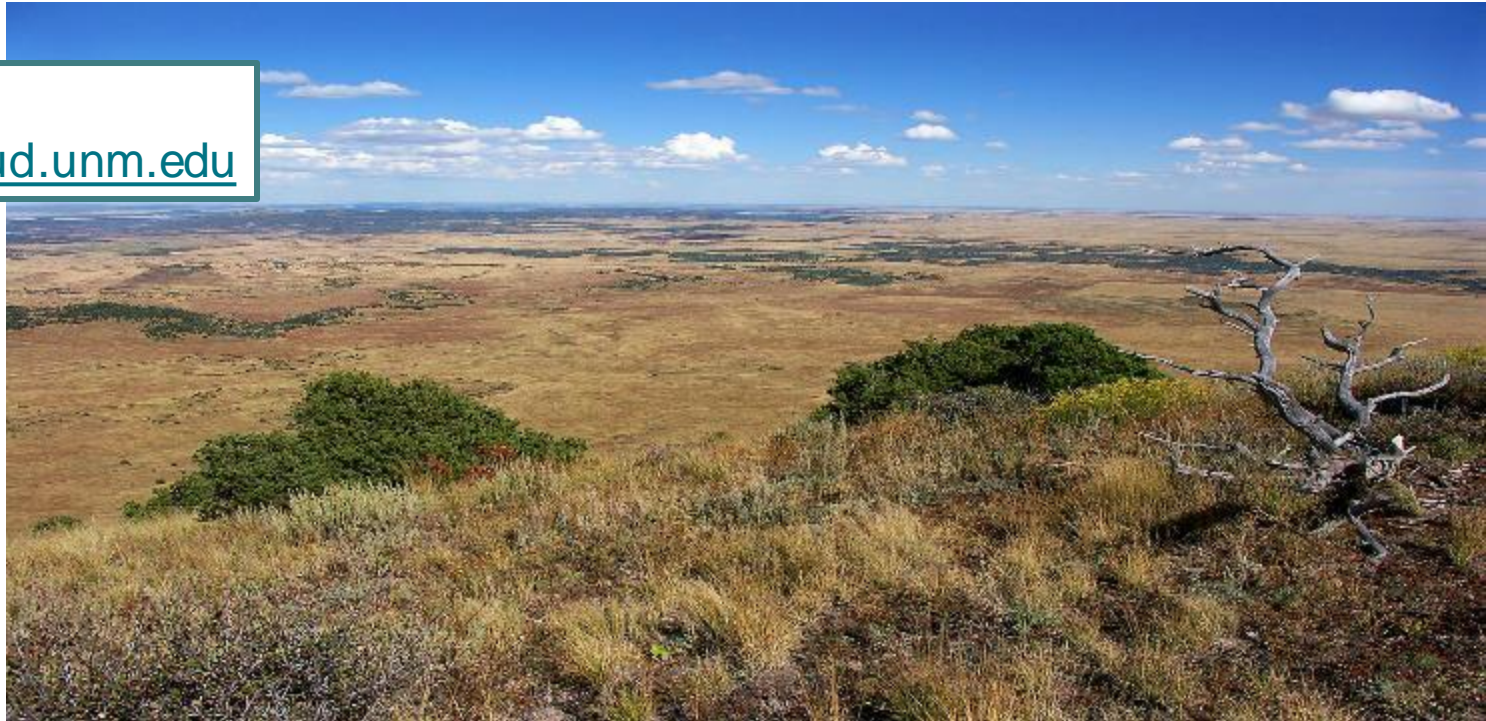
Image: New Mexico scene with desert grass and hills with blue sky.