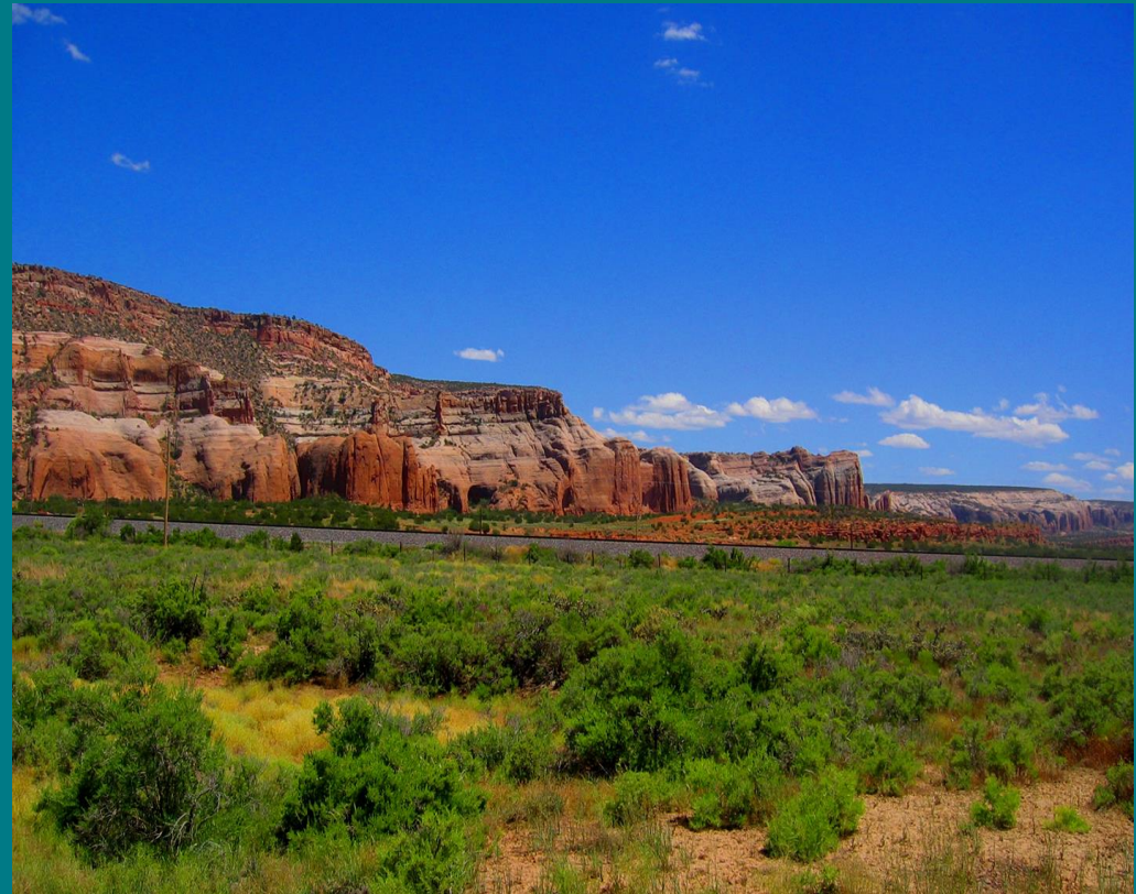
Image: New Mexico scene of red rock formation in the background, green and yellow desert plants in foreground, and blue skies.

Alyx Medlock, M.S., CCC-SLP NM LEND Training Director