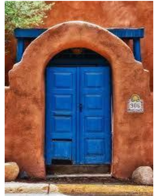
Image: Blue door in adobe arch.